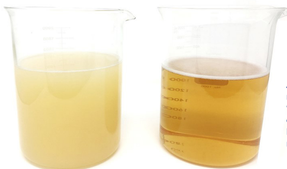
AquaEase Infinity cleaners retain their efficacy. Left: A “ready to dump” oil saturated cleaner. Right: AquaEase Infinity cleaner after the membrane process.

Total savings after lease is factored in: $37,300 (lease cost is $2,200/month)